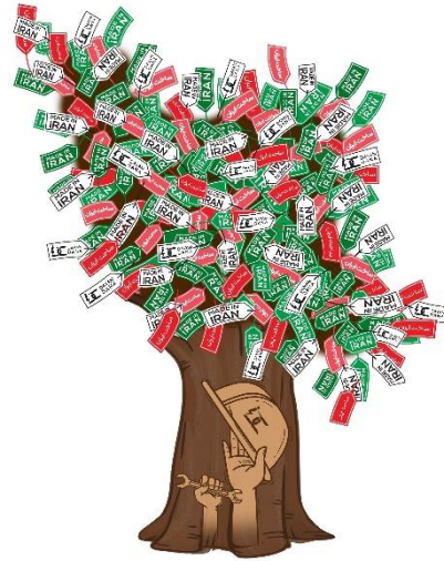
ساخت ایران بخریم، ایران ساخته خواهد شد.